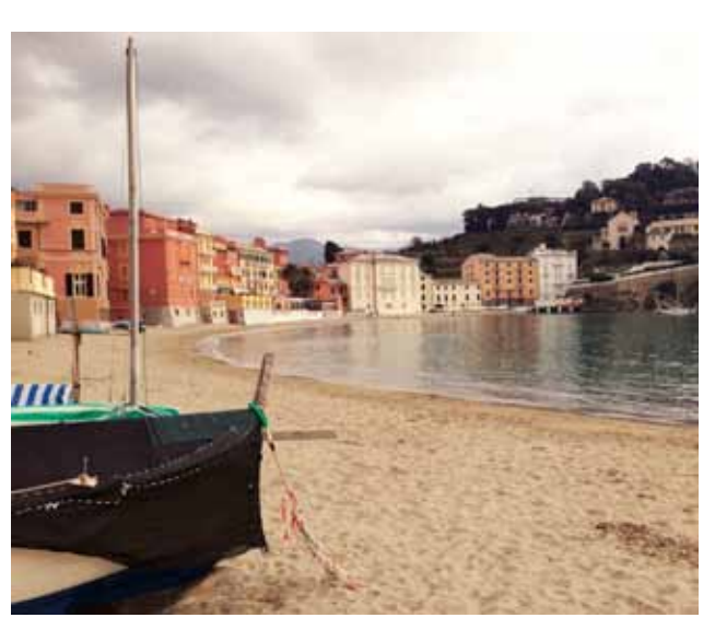
ABC Centro di Lingua e Cultura Italiana - Centro di studi linguistici