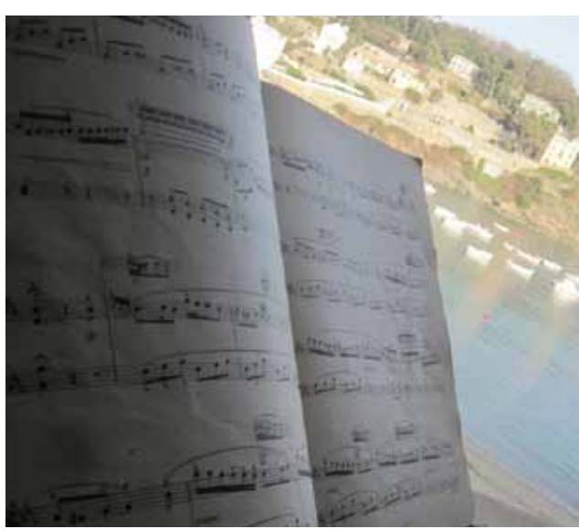
ABC Centro di Lingua e Cultura Italiana - Centro di studi linguistici